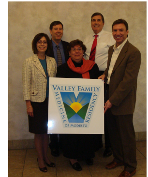
Members of the VCME Board celebrate the first of hopefully many residencies and Internal Medicine residents.

The timing couldn't be better. Health reform is likely to put additional pressures on health systems in the near future. The Valley Family Medicine Residency of Modesto has a proven record of training physicians who stay in the region. We are now exploring the feasibility of residencies in Orthopedics, and Emergency Medicine, as well as partnering with San Joaquin County for co-training of Surgery